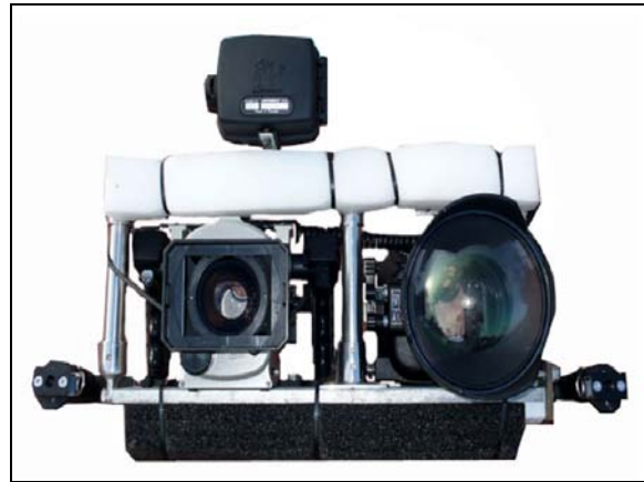
Figure 1. Second-generation mosaic imaging system with Sony HVR-A1U camera and underwater housing (left), Nikon 10 MP still and housing (right) and 3.5" LCD color video monitor (top).

The second-generation mosaic imaging system was created using commercially available components, including a Nikon D200 10 MP Digital SLR camera and Ikelite underwater housing, Sony HVR-A1U HDV video camera and Amphibico housing, and a 3.5" LCD color external monitor. All components of the enhanced mosaicing system were mounted in an aluminum/stainless steel frame (Fig. 1). The enhanced acquisition hardware allows for simultaneous collection of video and photographic stills using two independent cameras mounted on the same frame.